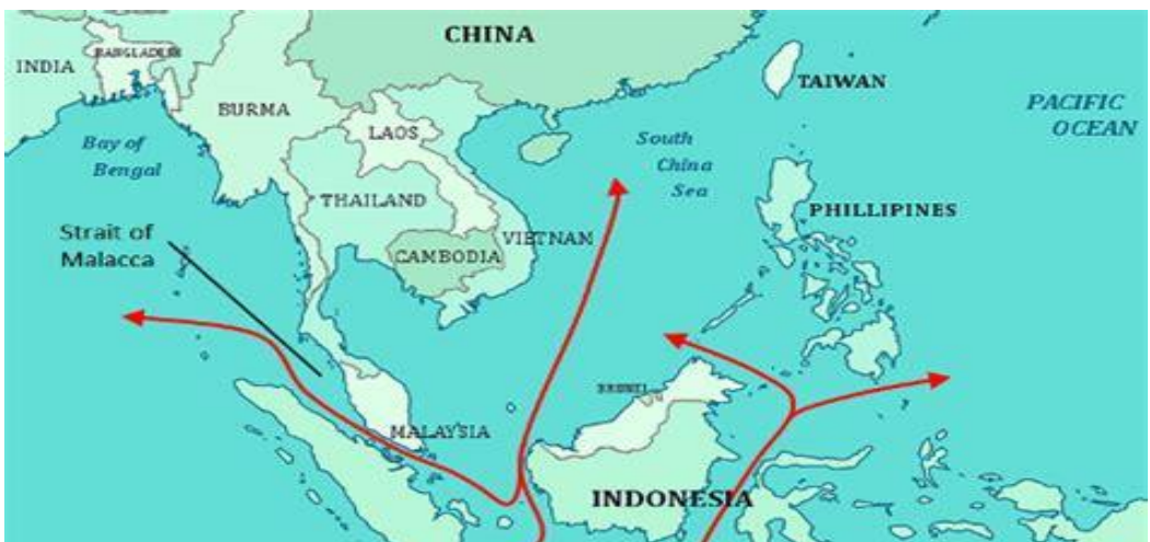
Figure 1.2.2: Straits of Southeast Asia

The region houses Sea Line of Communications (SLOCs) which are undoubtedly the most important maritime trade lanes in the world. The Malacca Strait houses is considered as the Second largest Oil trade route (Strait of Hormuz being the 1 st one). It is worth mentioning that approximately 16 million barrels of oil passes through Malacca Strait in a single year (Villar & Hamilton, 2017). Besides Malacca, other trade routes are also available in the region namely Straits of Sunda and Lombok, though these routes have less capacity than the Malacca. South China Sea in the region houses almost 25% of total global shipment in a year (trade worth approximately $5.3 Trillion).