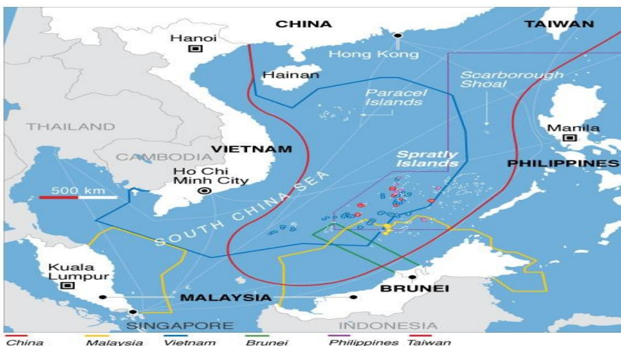
Figure 1.5.2: South China Sea Dispute

An overview of Chinese domestic consumption of energy indicates that Chinese oil demand increased from 2.3 million barrels per day (mb/d) in 1990 to 4.4 mb/d in 2000. The situation is further compounded in 2009, where the oil demand had jumped to 8.1 mb/d. Such a huge domestic consumption pattern highlights that by 2035, the country's oil demand will be soaring high to 15.3 mb/d. Correspondingly, US which at present is the leading oil consumer with 14.9mb/d, would be behind China in their energy consumption. It is pertinent to remember that Chinese sustained growth is directly proportional to availability of required energy cargo for domestic consumption (Shaofeng, 2010).