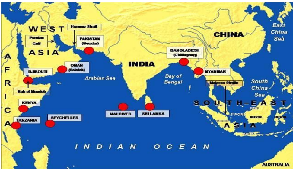
Figure 1.6.2: String of Pearls

The maritime security vulnerability of Malacca Strait offers an alternative in shape of China-Burma pipeline and also the construction of railway line from China to ASEAN countries. Such mega projects are not only going to enhance Chinese connectivity with the region, but also ensure availability of alternative means for transportation of energy shipments (Zhang, 2008).